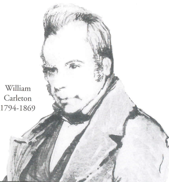
William Carleton 1794-1869