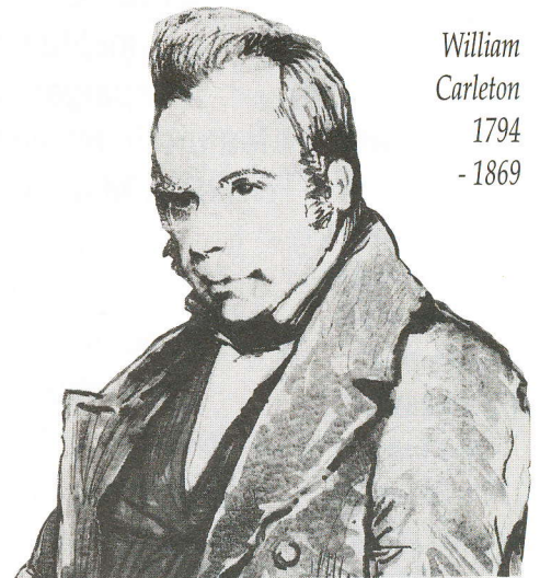
William Carleton 1794 - 1869